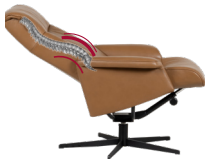
Dynamic lumbar support