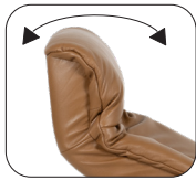
Head and neck support