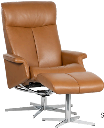
Steel chrome base 33

We offer four different base options. Wood base 55 is available in different wood finishes.