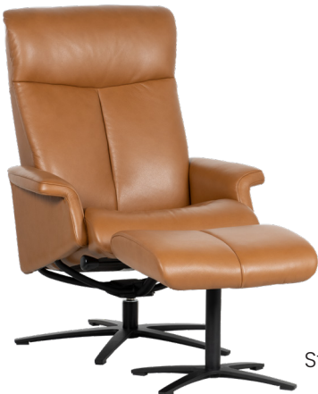
Steel black base 66