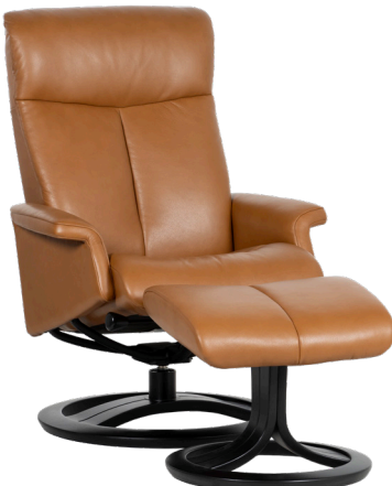
Wood base 55