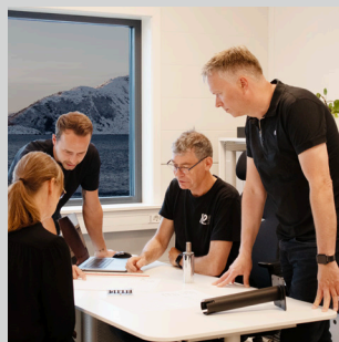
R&D Management Team