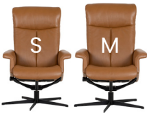
Two sizes for perfect fit