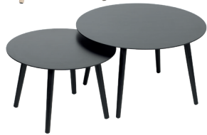
Round table in large and extra large size.