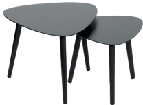
Triangle table in medium and large size.