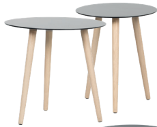
Round table in small and medium sizes

We offer different sizes, shapes, and heights. Great choices for those looking for durable and low maintenance tables that can withstand daily use and look great for years to come.